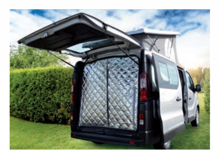
Suitable* for campervans & converted vans: