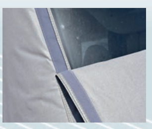
Fold down front with hook-andloop fasteners