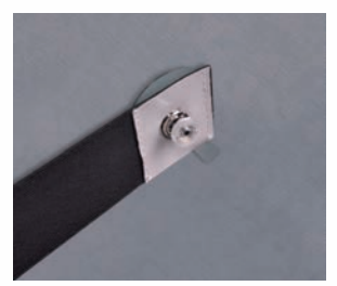
Fixation inside the vehicle with heavy-duty suction pads: strong assembly on any vehicle, even if fitted with cab screens