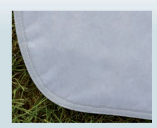
Focus on synthetic textile external sheet and finish edging