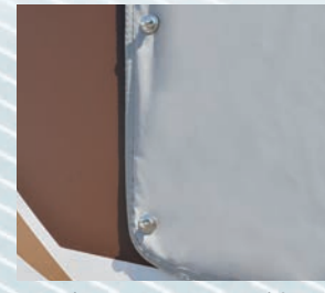
Hanging on passenger side using Tenax<sup>®</sup> self-locking fasteners