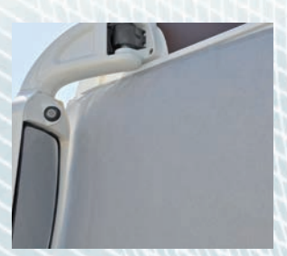
Isoval® Intégral comes developed for each vehicle kind, offering a perfect assembly, thus ensuring perfect insulation